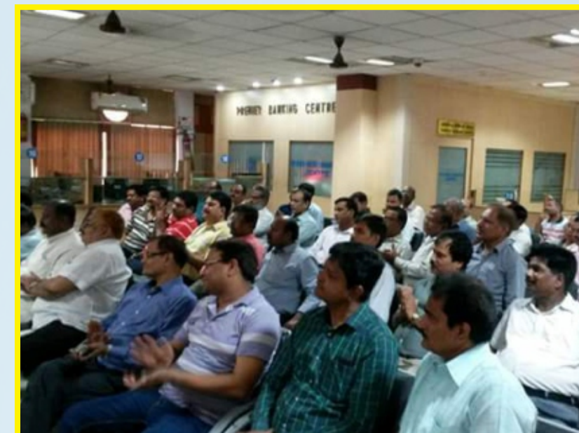
SBIOA, Bhagalpur Zone has organized Officers meeting at Bhagalpur