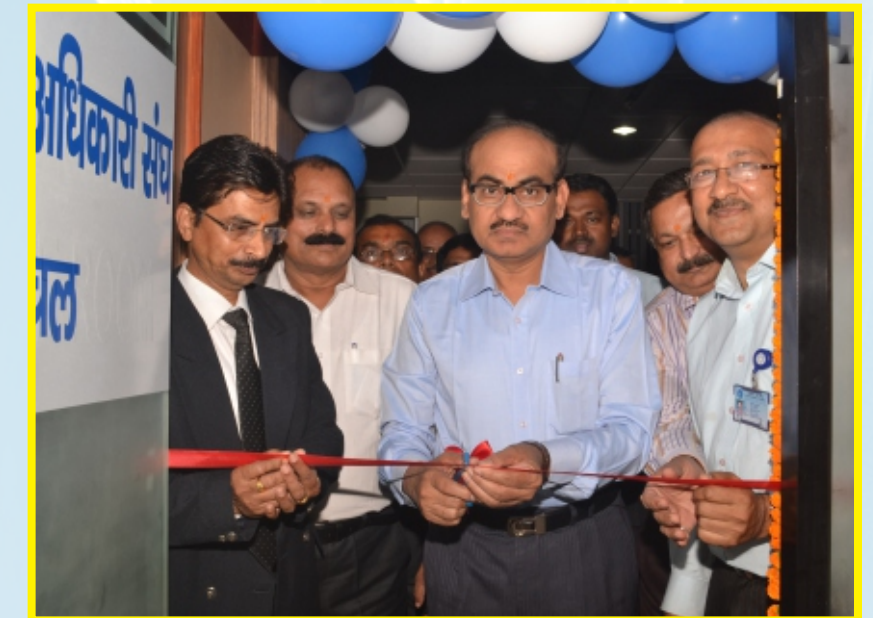
Inauguration of SBIOA office at Zonal Office, Deoghar